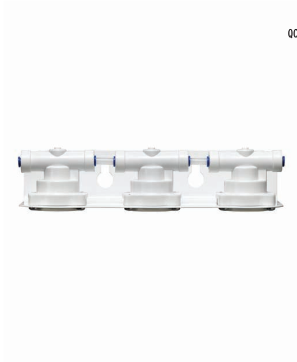
QCP Triple Head: EV9107-23

Filter head exclusively for Everpure QCP replacement cartridges